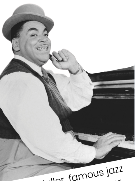
Fats Waller, famous jazz pianist and composer