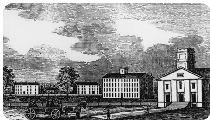
Oberlin Conservatory, Ohio

By age 14, he was playing for his local church. He later studied piano and composition at the Oberlin Conservatory and was the first black American to complete a Bachelor of Music degree there in 1908.